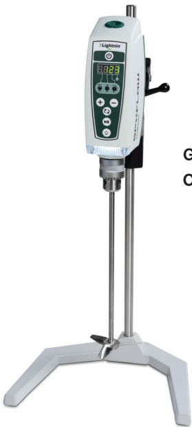
GP2 Universal Clamp Mount