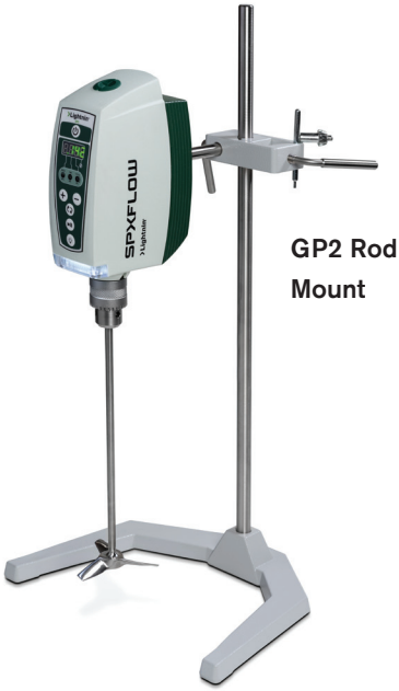
GP2 Rod Mount